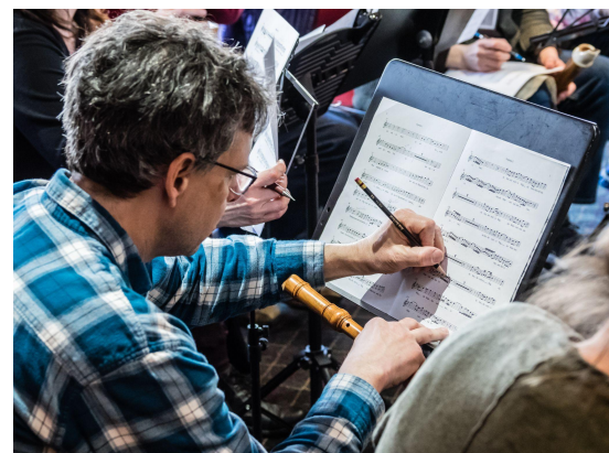
Menucha, 2019