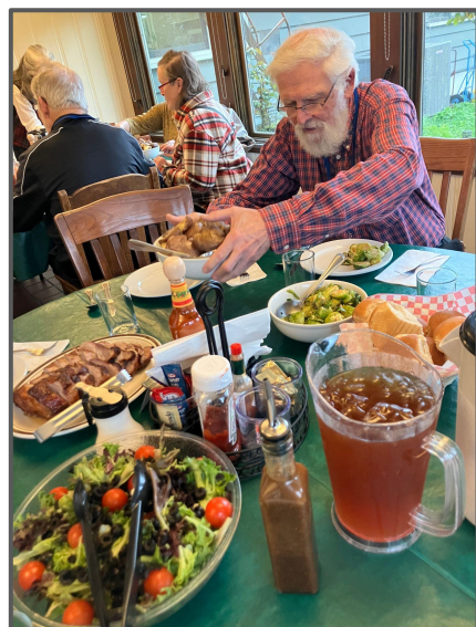
Lunch serving at CGEMR at Menucha