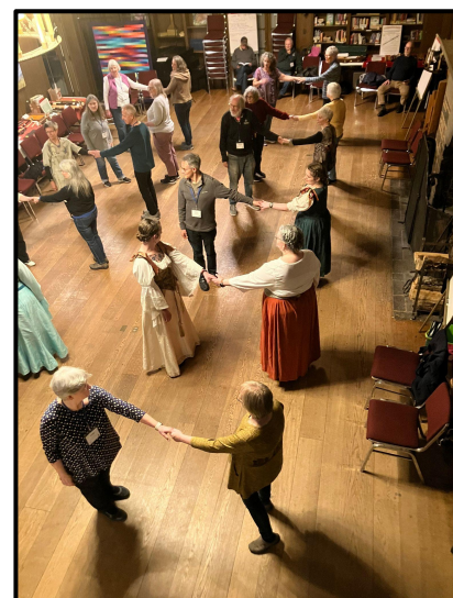
Dance lines at Menucha, 2024