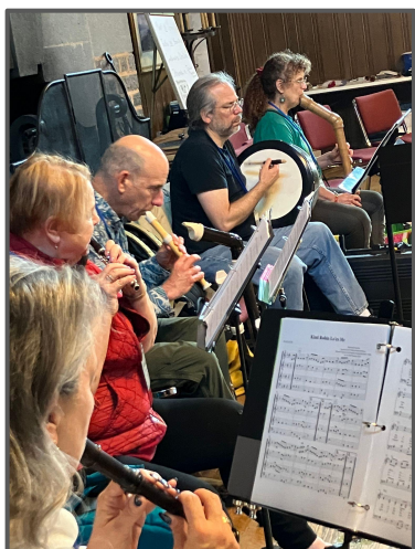
Celtic Dance band at CGEMR at Menucha