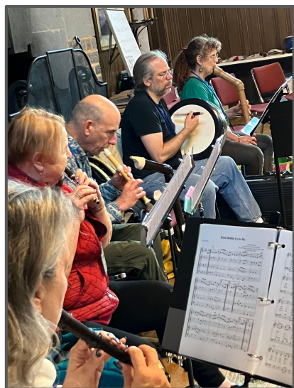
Celtic Dance band at CGEMR at Menucha