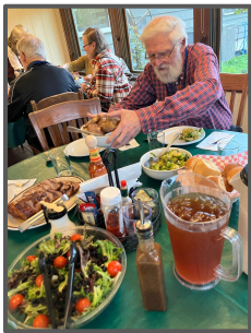
Lunch serving at CGEMR at Menucha