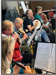
Celtic Dance band at CGEMR at Menucha