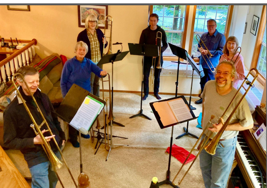
Recorder players sneaking off to hold a sackbut gathering