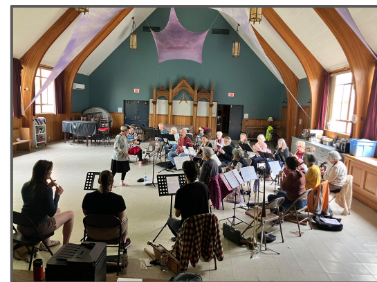
Big turnout at the April PRS playing session!